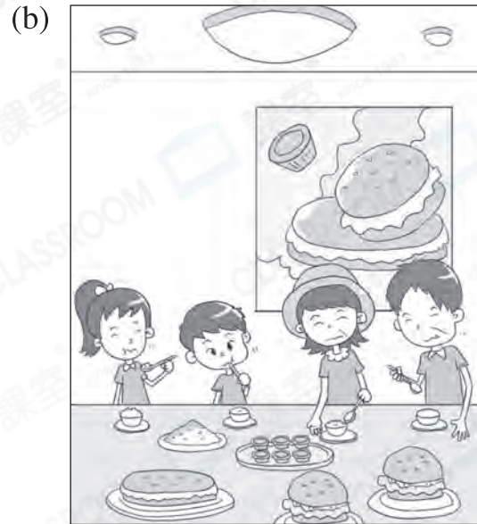
Portuguese egg tart / yummy