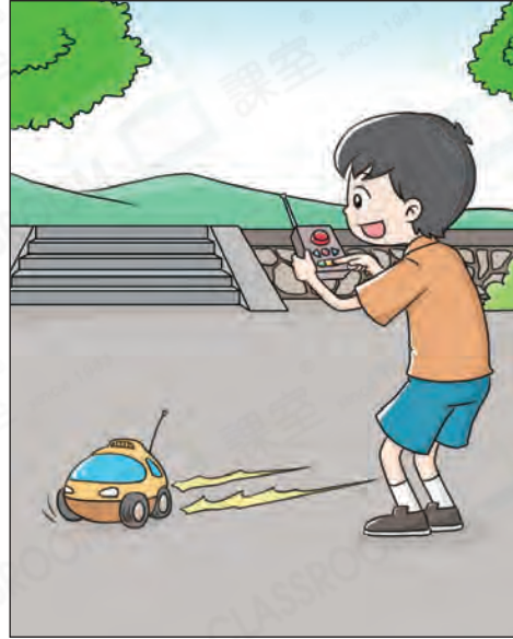
press / button / faster