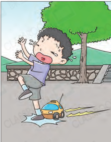
run into / fall over