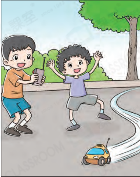
remote-control car / excited