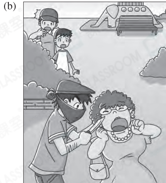
knife / scared / loudly