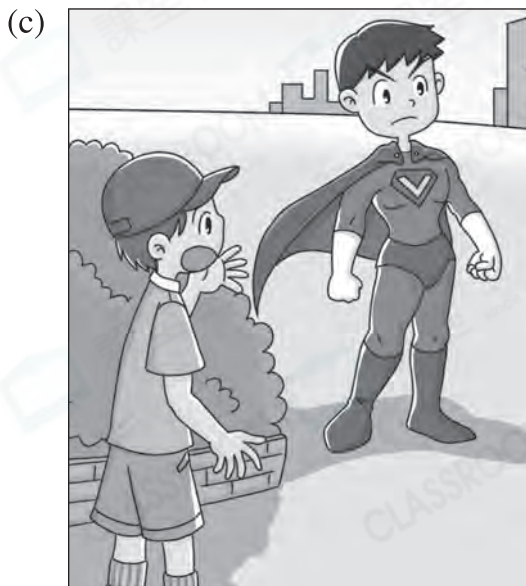
transform / superhero