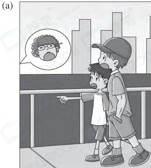
follow / find out / happen

You are James. You found out a secret about your best friend, Daniel, when you were walking in the street with him yesterday. Based on the pictures below, write a story about what happened. You may read the samples on the right before writing your own. Write at least 80 words.