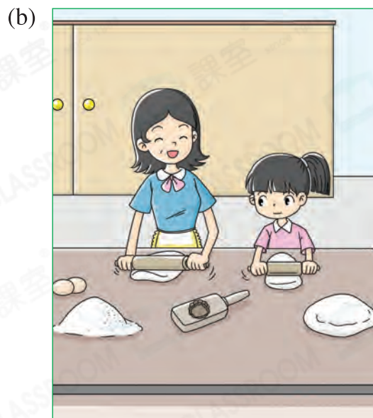
moon cake / delicious