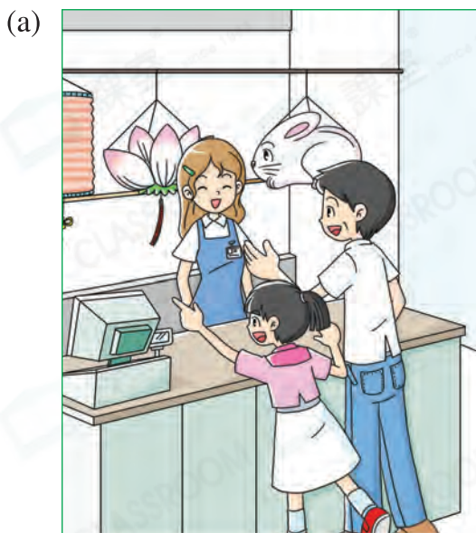
lantern / shape

You are Grace. Your Net friend, Chris, is interested in finding out what you usually do before and during Mid-Autumn Festival. Based on the pictures below, write an e-mail to Chris about Mid-Autumn Festival. You may read the samples on the right before writing your own. Write at least 80 words.