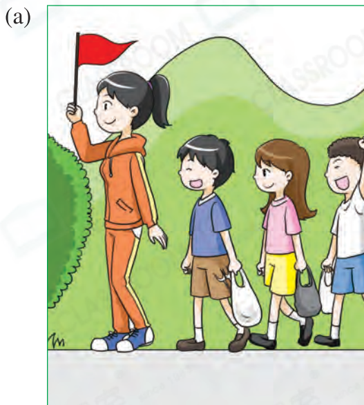
sunny / cool / excited

You are Peter. You and your classmates went on a school picnic yesterday. Based on the pictures below, write a story about what happened. Write at least 80 words. (30 marks)