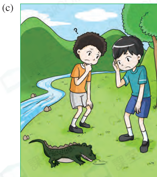
stream / baby crocodile