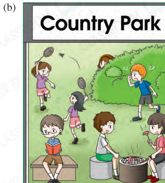
barbecue / hide-and-seek