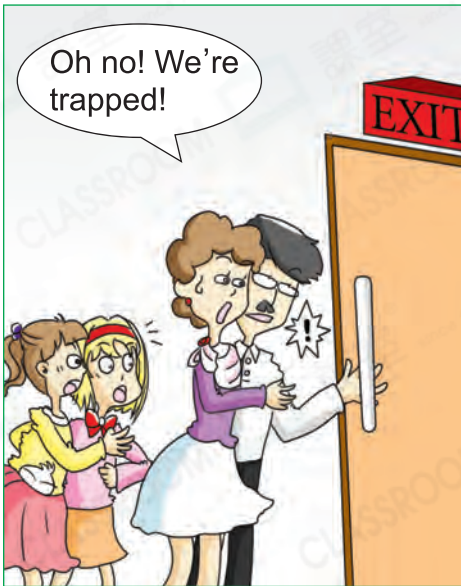
emergency exit / locked