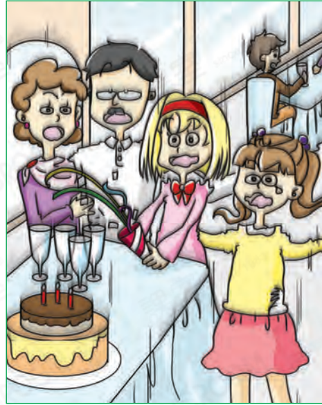
earthquake / shake / frightened