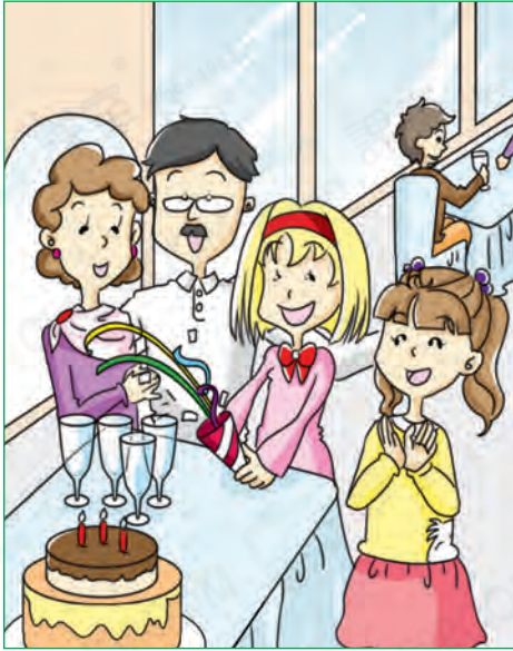
sing / happily