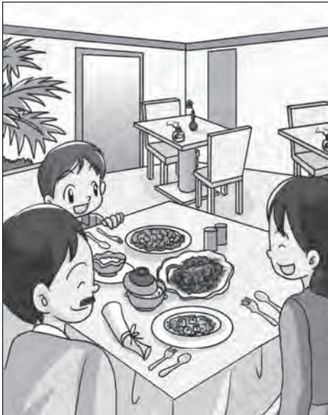
Thai food / spicy