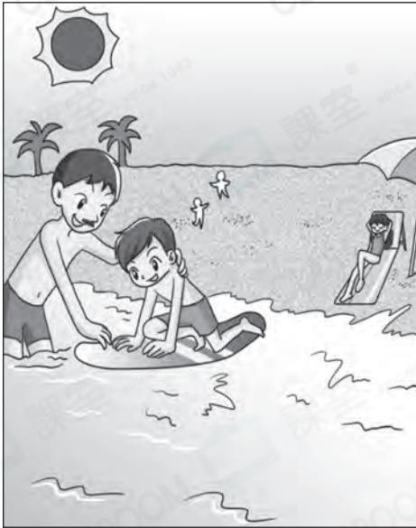
beach / surf / sunbathe