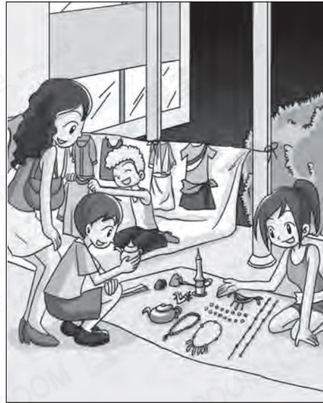
night market / souvenir