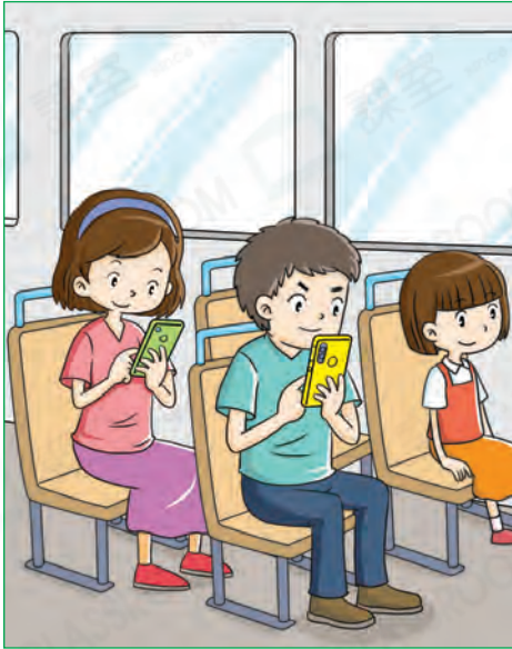
packed / phone