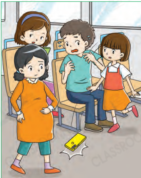
offer / seat / knock over