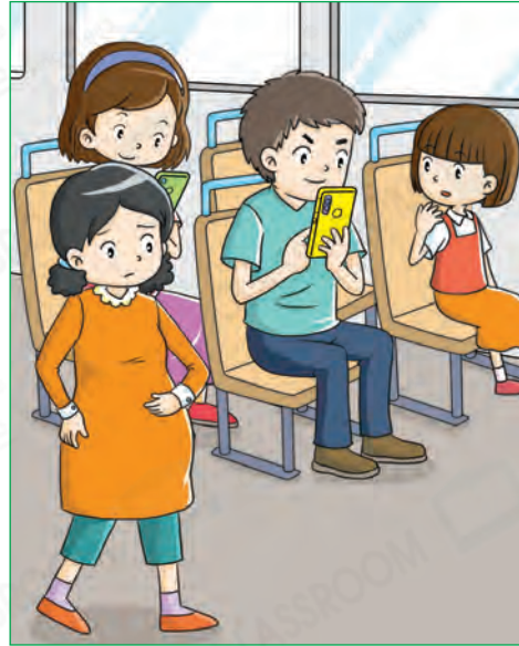
pregnant / get on