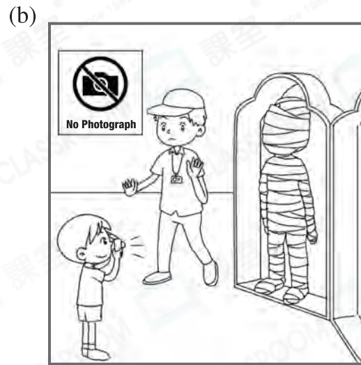
mummy / coffin / security guard