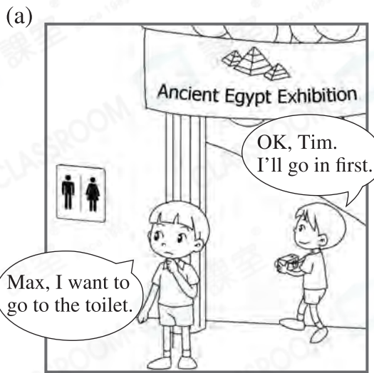
visit / eager

36. You are Max. You went to the Art Museum with your friend Tim yesterday. Based on the pictures below, write an e-mail to your friend Jane about what happened. Write at least 80 words.