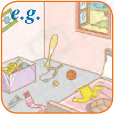
Tim does not clean his room.

A. Mr Turtle is talking about his family. Look at the pictures and fill in the correct adjectives to find out what Mr Turtle is saying.