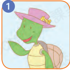
She says 'thank you'.