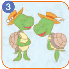
She makes me laugh.