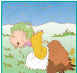
look at the stars / sleep on the grass

E. Isabel is talking to Matt and Hugo. Look at the pictures and complete the conversation with the help of the given words.