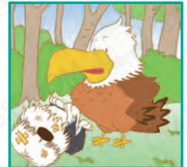
lie on the ground / walk along the path