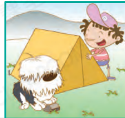
put up our tent / pick stones