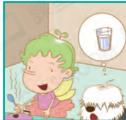
cook dinner / ask me for water