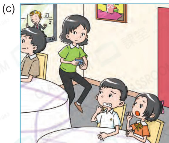
take away / shocked / shout