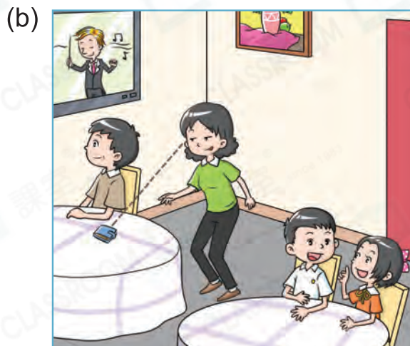
stare / wallet