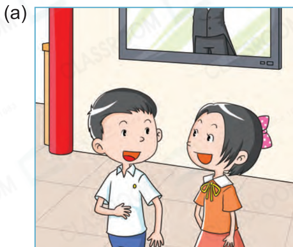
restaurant / hungry

You are Kevin. You and your classmate, Tina, went to have afternoon tea yesterday. Based on the pictures below, write a diary entry about what happened. Write at least 80 words.