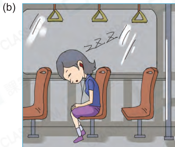
listen to / fall asleep