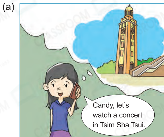
invite / excited

You are Mary. You fell asleep on the bus yesterday. Based on the pictures below, write an e-mail to your cousin, Sandy, about what happened. Write at least 80 words.