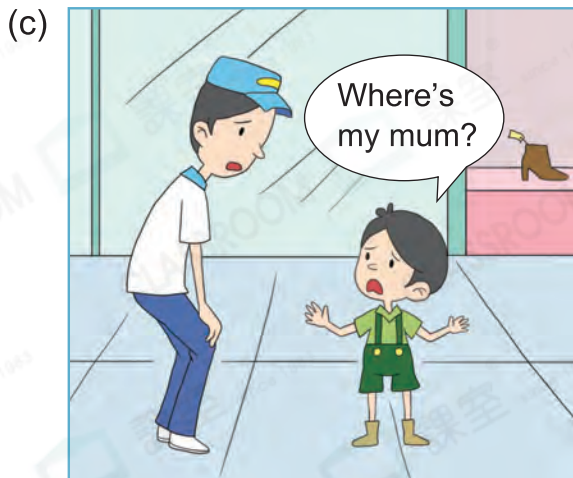
worried / help