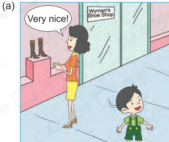
buy / boots

You are Johnny. You went to a shopping mall with your mum last Saturday. Based on the pictures below, write a story about what happened. Write at least 80 words.