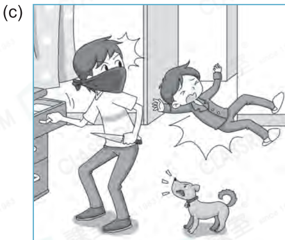
alert / trip over