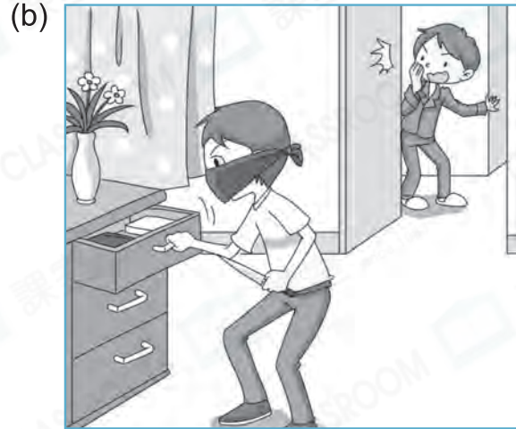
burglar / search