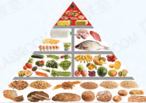
The food pyramid