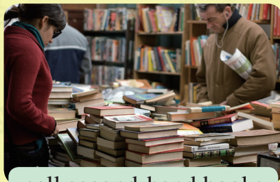
sell second-hand books