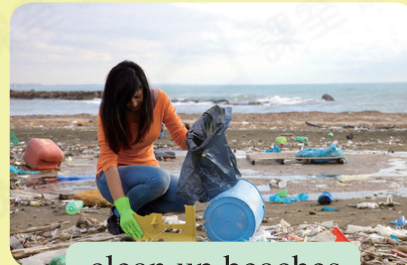
clean up beaches