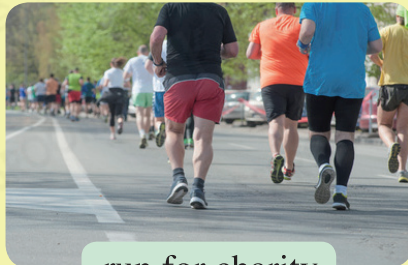
run for charity