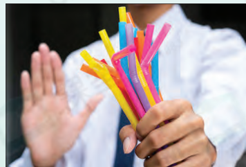
Take action now! Say 'No straw, please!' when you order a drink.

The movement to ban the use of plastic straws is growing, with the support from big companies such as Starbucks and American Airlines which announced that they will phase out plastic straws in the coming years. You may consider using paper, bamboo and stainless steel straws as alternatives or, better still, try to say 'no' to straws when you take your next sip!