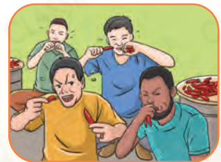
You try to eat as much spicy food as you can.