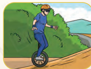
You ride a vehicle with one wheel in a difficult environment.