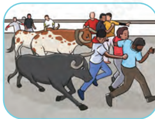
You race away from angry animals.