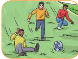
You chase after a dairy product.