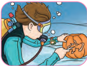
You cut shapes and patterns into a vegetable.