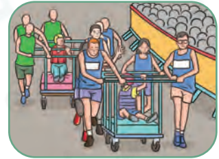
You race while pushing a piece of furniture.