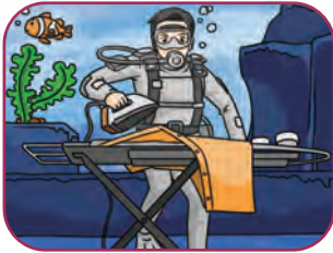
You straighten clothes at an unusual location.