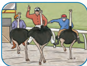
You race by riding a bird.